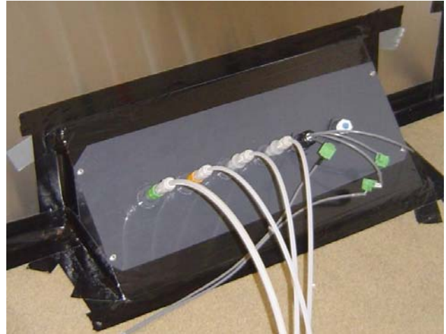
Under Door Plate (Part #: CSI-ROOM001) Unit Dimensions: 8.5" x 8.5" x 24" Unit Weight: 5 lbs

The user only needs one (1) under the door plate since it moves from room to room. This makes the Mindox or Cloridox system installations simple and easy.