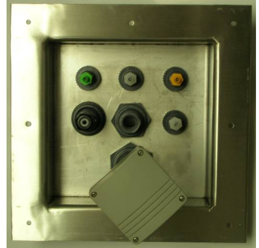
Door Plate (Part #: CSI-Room006 or -Room007) Unit Dimensions: 13.0" x 13.0" x 2.75" Unit Weight: 10 lbs

In addition to the Door Plate, a gasket and locking collar is provided to sandwich the gasket providing a seal to prevent gas from leaking during the decontamination process.