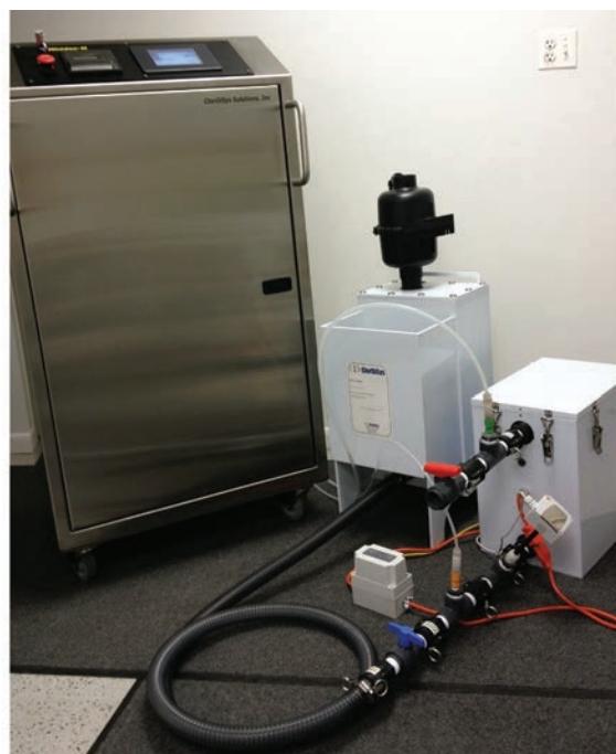
Figure 1. Decontamination equipment, using a Minidox-M Decontamination System (ClorDiSys Solutions).

Chlorine dioxide exposure. Chlorine dioxide gas (ClO 2 ) was generated by using the Minidox-M Decontamination System