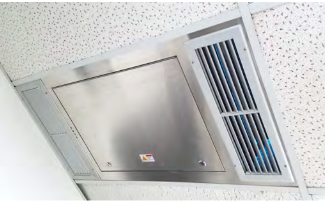
TORCH AIRE- RECESSED

TORCH AIRE- RECESSED: Continuously kill aerosolized organisms flowing throughout a space, even when occupied. Enclosed UV-C bulbs kill organisms, and trap large particulates that may be flowing with air.